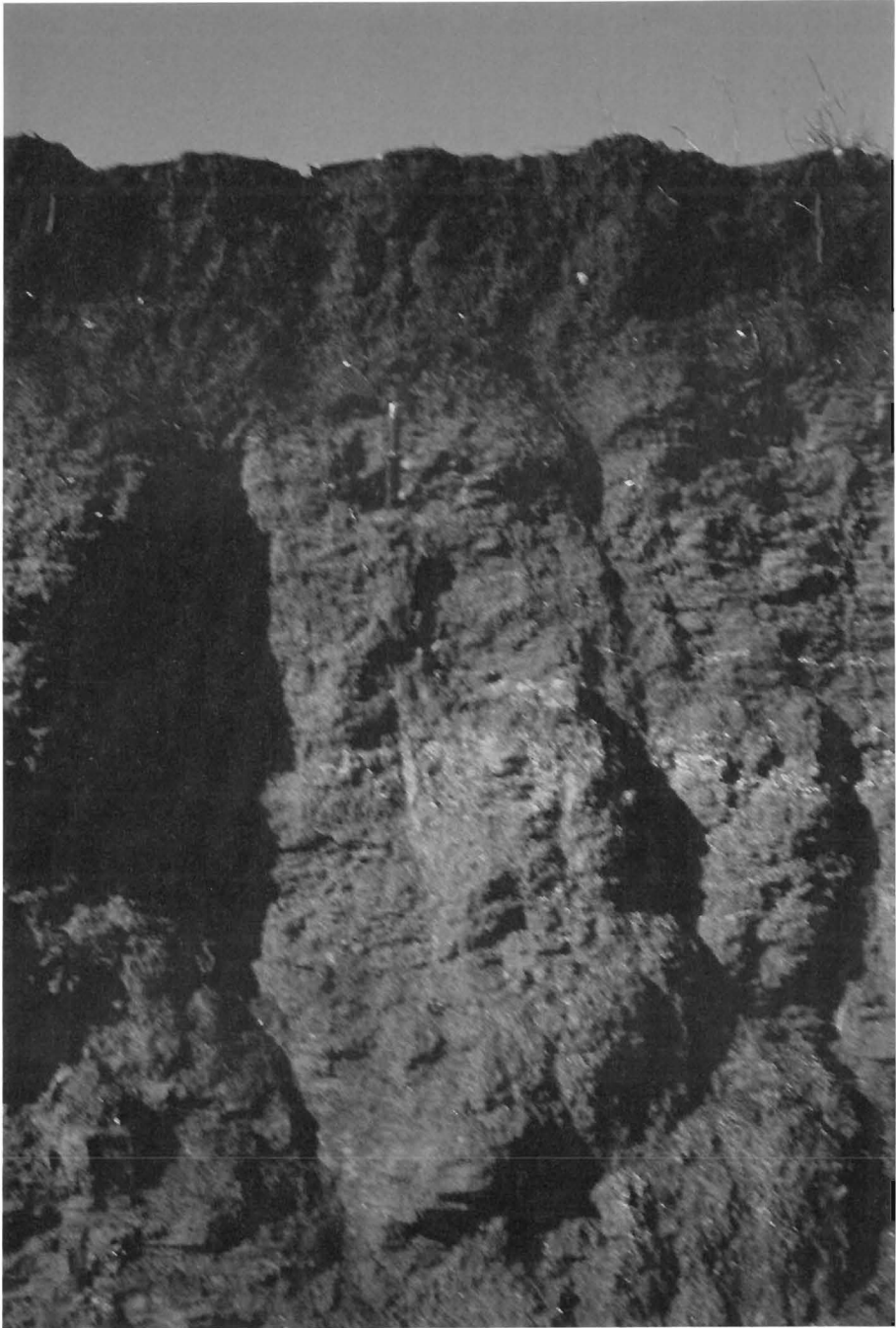
FIG. 4.—Typical Vertisol formed over silty clay alluvium with sand and gravel underlain by weathered basalt.