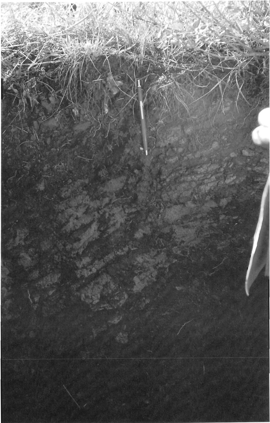
FIG. 1.—Inceptisol over basalt.