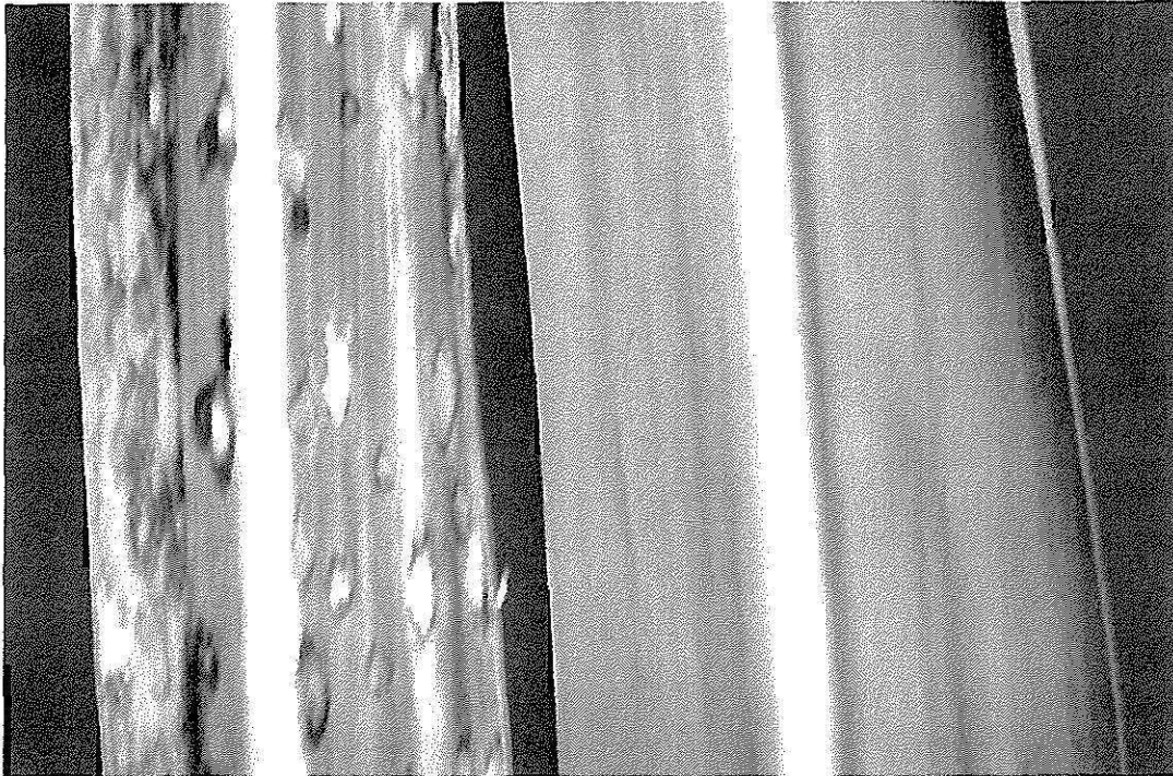
FIG. 1.—Symptoms of ring spot ( Leptosphaeria sacchari ). Note elliptical spots with ashen-grey centers surrounded by purplish brown rings (left). Healthy leaf at right.

The first symptoms were characterized by the production of small purplish flecks on the surface of the older leaves. The spot was at first circular or elliptical, reddish brown, with an indistinct margin, but later dried in the center and became ashen-grey surrounded by a purplish brown resulting in a ring-spot appearance (fig. 1.). The lesions were generally most abundant towards the tip of leaves. On the upper side of the older spots a large number of minute black dots (perithecia and pycnidia) were