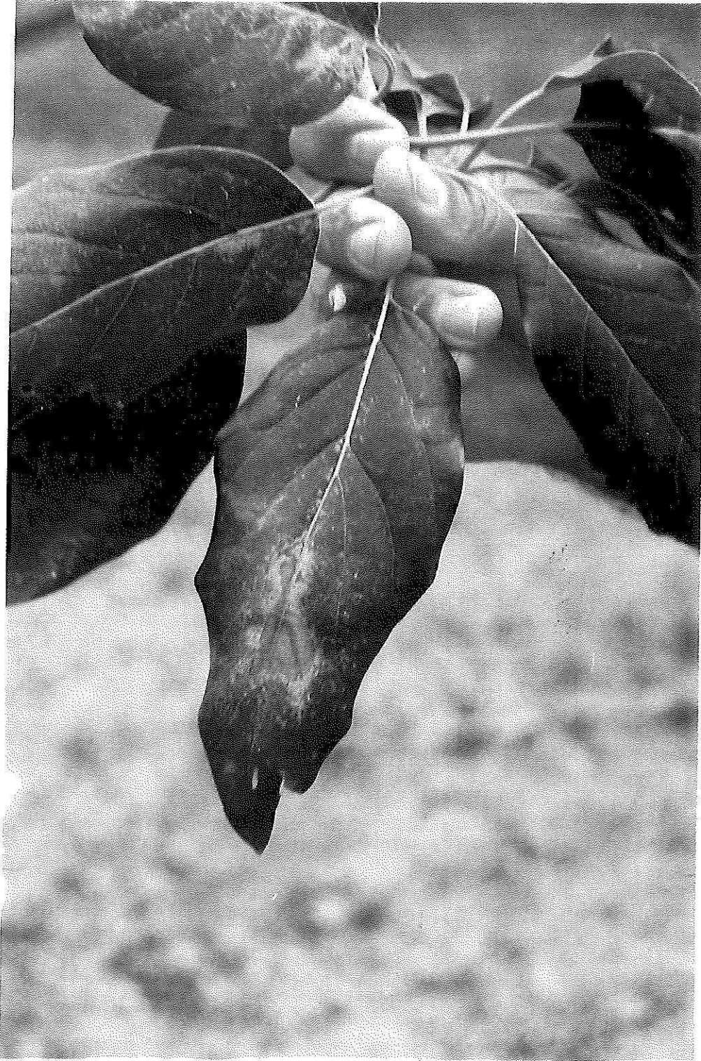
Fig. 3.— Peudacysta perseae (Heidemann) damage to avocado leaves.