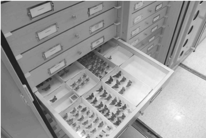
FIGURE 1. Lepidoptera Collection of the Agricultural Experiment Station Insect Research Collection (AES-IRC) at the Museum of Entomology and Tropical Biodiversity.

A significant number of entomologists working at the AES, some of them with a dual preparation in entomology and botany, have contributed detailed studies leaving a legacy of ecological observations (Figure 2), voucher specimens, graphic material and documents. This legacy is available today thanks to the culture of publishing peer-reviewed articles, circulars, bulletins, annual reviews, notes and newspaper articles.