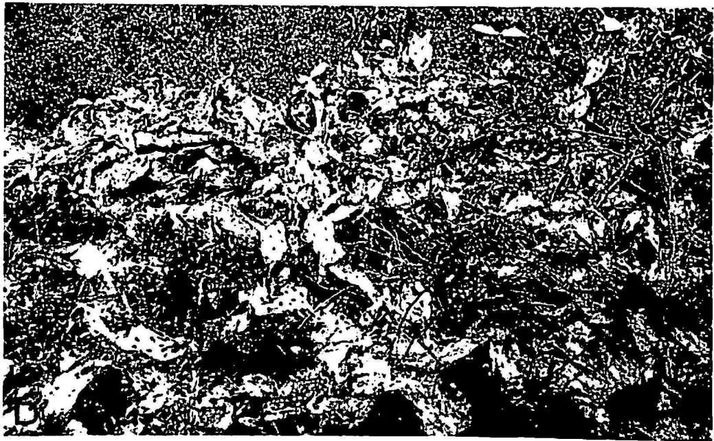
FIG. 1, D. Opuntia dillenii patch destroyed by Cactoblastis cactorum at Desecheo Island, Puerto Rico.

genus Opuntia (fig. 1, C, D). The insect has been used for the particular purpose of controlling cacti biologically in South Africa, Mauritius and Hawaii.