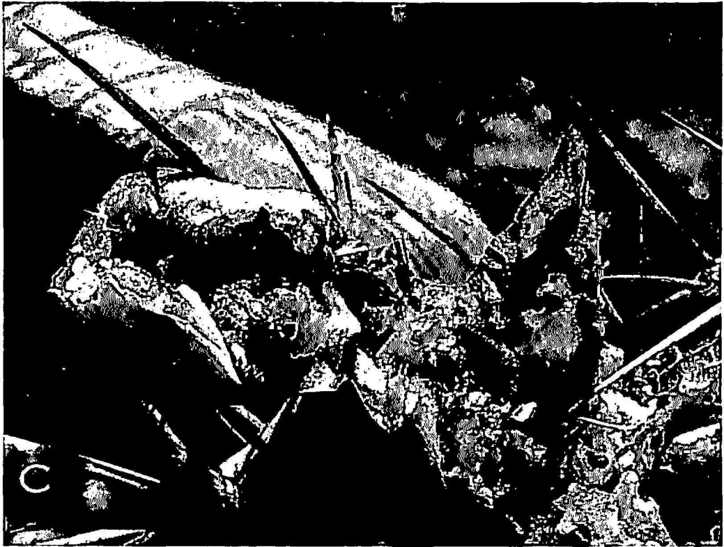
FIG. 1, C. Cactus pad opened to show C. cactorum larvae feeding within.