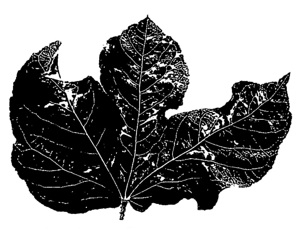
Fig. 1.—Leaf of Jatropha gossypifolia with symptoms induced by the Jatropha mosaic virus.

Bird (3) found another virus later bearing no relationship either to Jatropha or Sida viruses but transmitted by B. tabaci race sidae. This virus is called "Rhynchosia" virus, after the generic name of its primary host,