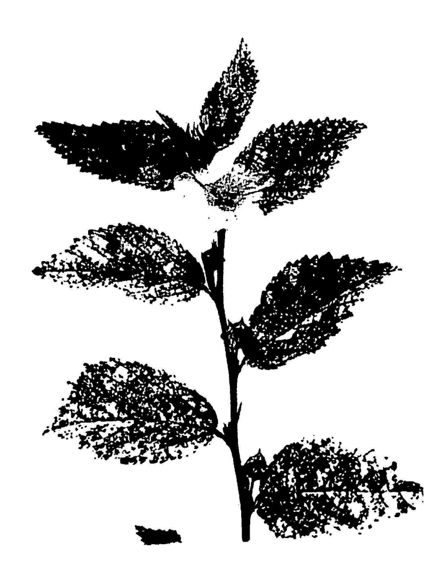
Fig. 2.—Characteristic symptoms of the mosaic of Sida carpinifolia (host—Sida carpinifolia).

don stage. The host range of the Rhynchosia virus, and the general symptomatology it induces on certain species, indicates a relationship to the yellow mosaic virus of Phaseolus lunatus L., studied by Capoor and Varma (4) in India, and to the yellow mosaic of Phaseolus longepedunculatus Mart., investigated by Flores and Silberschmidt (6) in Brazil.