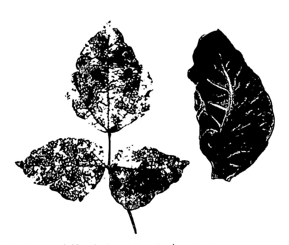
Fig. 3.—Leaves of Rhynchosia minima (left) and Nicotiana tabacum (right) affected by the mosaic virus of Rhynchosia minima.

It was determined more recently that the golden-yellow mosaic (fig. 5) of Jacquemontia tamnifolia Griseb., another convolvulaceous weed, is spread by the sidae race of B. tabaci. The host range of this new virus is rather limited as evidenced by the fact that heretofore only two plant species, besides the primary host, have been successfully inoculated via the whitefly vector.