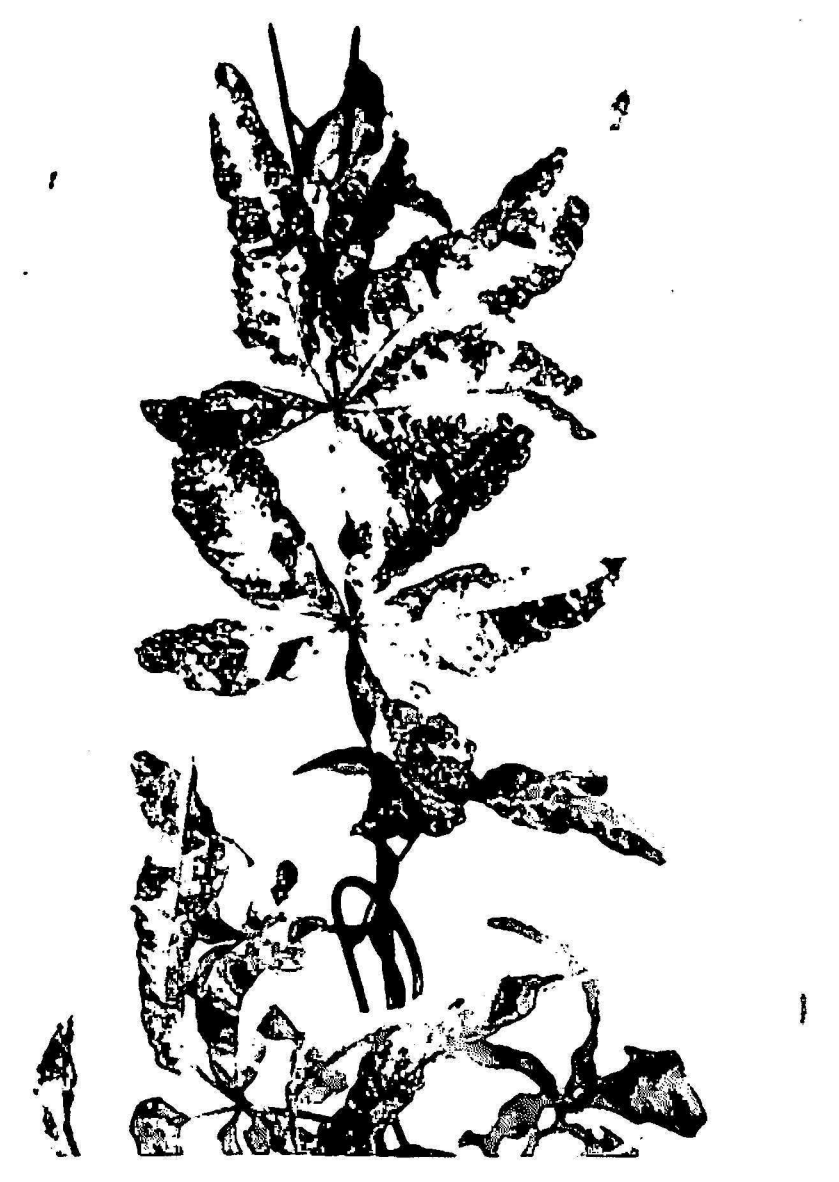
Fig. 4.—Mosaic-affected leaves of Ipomoea quinquefolia (causal agent—mosaic virus of Ipomoea quinquefolia ).

A seemingly new yellow mosaic destroyed a large bean planting of the