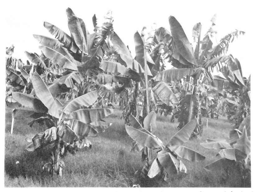
FIG. 2.—Plantain plants of the second crop: front plot, untreated control; back plot, treated with the granular nematicide Dasanit.

During the first ration the treatments with Nemagon granules, D-D and E-D-B, at the dosages and time intervals applied, proved their ineffectiveness by the relatively low yields obtained. At the time of the second ration, plants from these treatments had died.