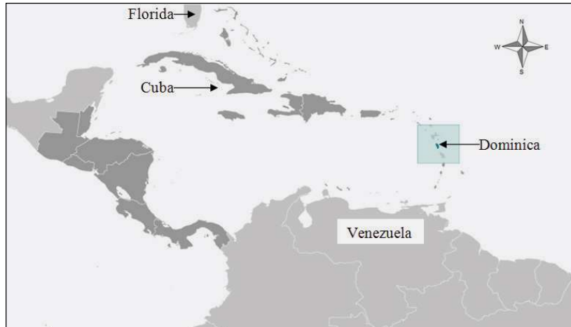
Figure 1. Geographic location of the Commonwealth of Dominica.